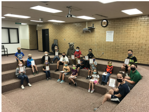
September Leopard Leaders

Students will be working on both individual and class goals. Leopard Leaders will be chosen and honored from each class in the school. Leopard Leaders are those students who are exemplifying good leadership qualities and treating students and staff with respect. Our school attributes are as follows: Leopard Leaders, Accept All, Respect Self, Show Success, Empower Others, and Notice Needs.