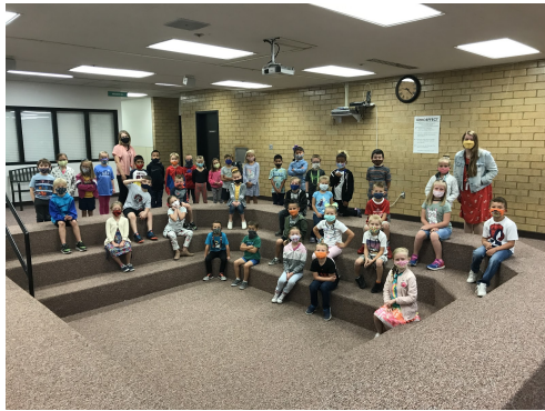
1st Grade- Best Lunchroom Manners