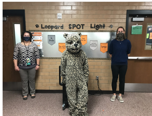
Legends of the Leap

Class goals for October are those who show the best manners, the best Art Specialty Class, and the highest % of students completing their home reading.