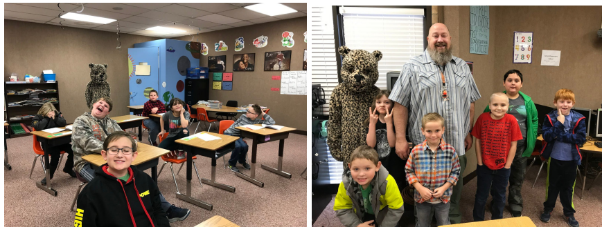
Best Computer Specialty