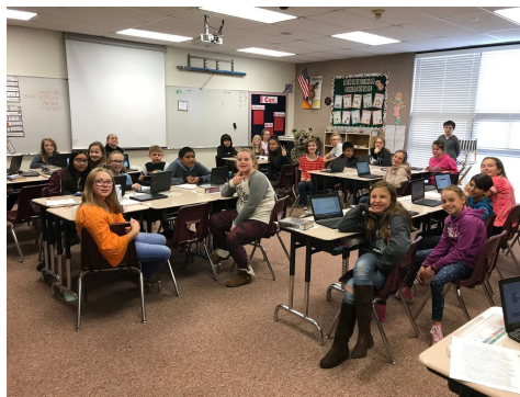
Highest Homework Percentage