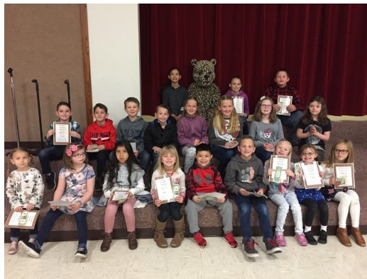
November Leopard Leaders