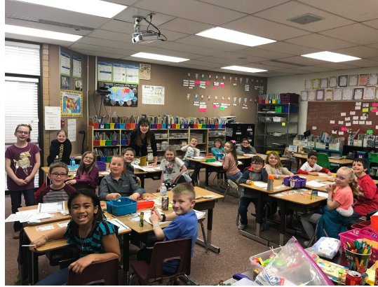
Best Lunchroom Manners