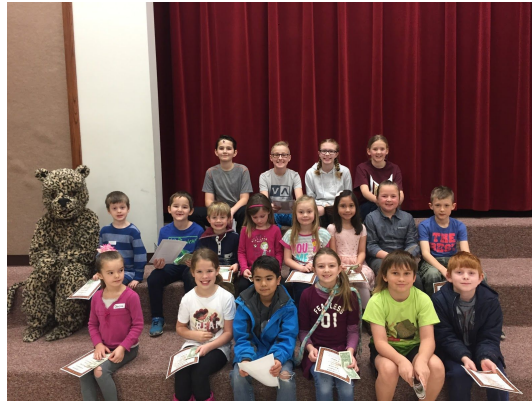
February Leopard Leaders