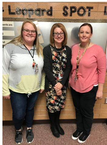
Legends of the Leap

Congratulations to February's Winners. Everyone, keep up the great work! Class goals for February are the fewest tardies, students being proactive at recess, and the cleanest classroom.